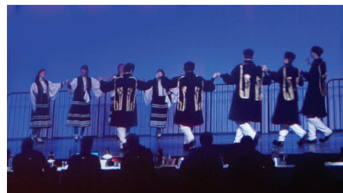
Paralia dances on stage at FDF 2014