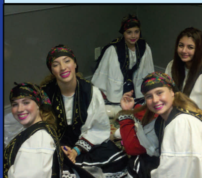
Picture Above: Paralia, our older dance team hanging out before getting ready to go on stage.