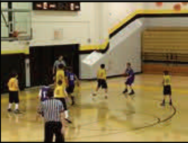
Our 1st Basketball game of the season was Sun. Feb. 23. We had one boys and one girls team compete against St. Nicholas from Northridge